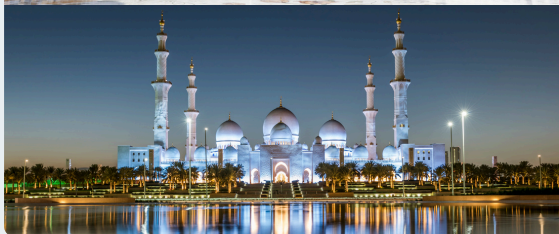
SHEIKH ZAYED GRAND MOSQUE