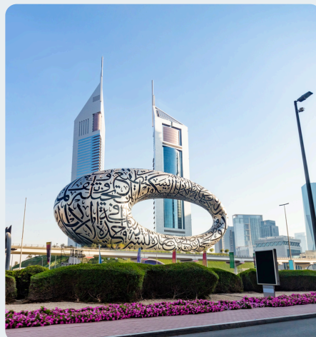
MUSEUM OF THE FUTURE